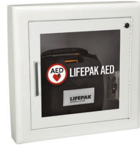
Recessed Mount (1.5" Return)

AED Wall Cabinet with Alarm, Fire Rated 11210-000026 (White)