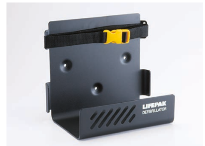
Wall Mount Bracket for LIFEPAK 1000 or LIFEPAK 500 Defibrillators 11210-000001