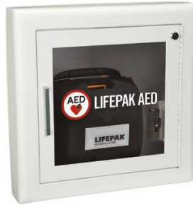
Semi-Recessed (3" Return)

AED Wall Cabinet with Alarm and Strobe 11220-000083 (White) 11220-000084 (Stainless)