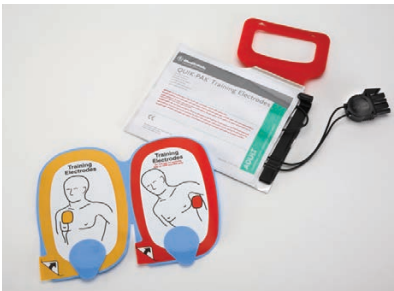
Clip-on Training Electrodes For use with QUIK-COMBO® patient simulators. Allows users to practice defibrillation electrode placement. 11250-000012 (5 pairs) 11250-000015 (5 pairs replacement)