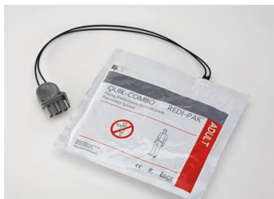
EDGE System™ Electrodes with QUIK-COMBO Connector and REDI-PAK® Preconnect System 11996-000017