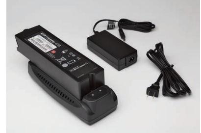
Rechargeable Battery Charger Kit (includes charger, power converter and power cord) 11140-000099