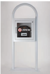
AED Floor Stand Cabinet with Alarm 52" tall 14" x 17-3/8" high x 7" deep 11210-000028 (White) 11210-000029 (Gray)

AED Wall Cabinet with Alarm, Fire Rated 11210-000027 (White)