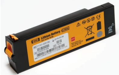
Replacement Kit 11141-000100 (Non-Rechargeable)