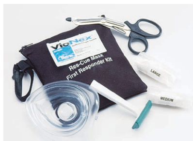
AMBU® Res-Cue Mask® First Responder Kit

Includes 2 sets of disposable vinyl gloves, 1 reusable mouth barrier mask with valve and filter, 1 disposable razor, 1 disposable anti-microbial wipe, and 1 pair of trauma scissors.