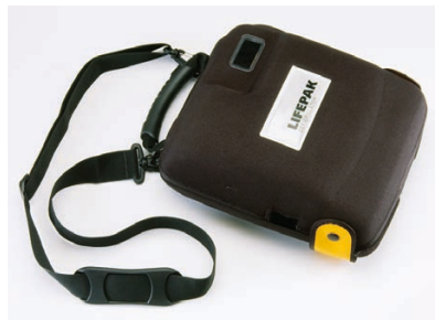
Soft Shell Carrying Case (Does not include shoulder strap) 11425-000007 11425-000012 (Shoulder Strap)