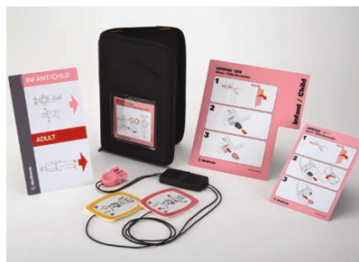
Infant/Child Reduced Energy Defibrillation Electrode Starter Kit

For use only with LIFEPAK 500 Biphasic AED with pink connector or LIFEPAK 1000 defibrillator, LIFEPAK EXPRESS AED, or LIFEPAK CR Plus AED. For use on children less than 8 years of age or under 55 lbs.