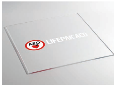
AED Cabinet Window Replacement Kit 21300-006797