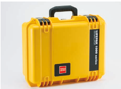
Hard Shell, Water-tight Carrying Case 11260-000023