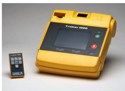
Trainer 1000 99996-000117