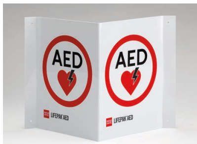
Tent AED Location Sign 11998-000332 (w/logo, 7" x 8")