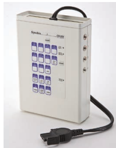
Patient Simulator (QUIK-COMBO) Connects directly to your LIFEPAK defibrillator for safe, interactive training. Select from 17 ECG rhythms including: fibrillation, tachycardias and bradycardias. 11996-000310 (3-Lead)