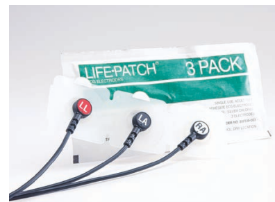
LIFE-PATCH® ECG Electrodes Adult, pre-gelled 11100-000001 (3 pk)