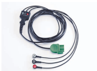
3-Wire ECG Cable (Lead II) 11111-000016