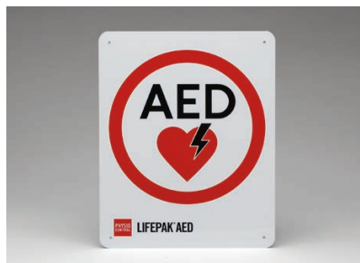
Flat AED Location Sign 11998-000330 (w/logo, 8" x 10")