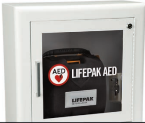
Surface Mount (7" Return)

AED Wall Cabinet with Alarm 11220-000079 (White) 11220-000076 (Stainless)