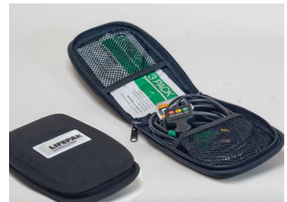
Accessory Pouch For 3-wire cable and/or other accessories. 11425-000001